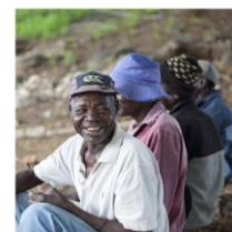
Older citizen monitoring: Achievements and learning

Older citizen monitoring is a social accountability tool and a process that promotes dialogue between older people, civil society organisations, governments and service providers.