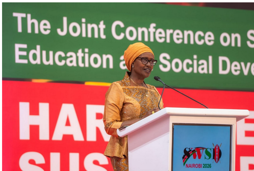
Hon. Winnie Byanyima, Executive Director of UNAIDS, addresses delegates during her keynote, Choosing Justice: Collective Responsibility in a Divided World .

Throughout the conference, participants highlighted the extraordinary commitment of social workers and social development practitioners who work alongside people and communities, recognising them as partners in shaping solutions. Drawing on indigenous and community knowledge, lived experience and collective strengths, social workers facilitate participation, protect rights and co-build pathways towards resilience, inclusion and hope. Together with educators, researchers and community partners, they contribute to lasting social change that is locally owned and globally connected.