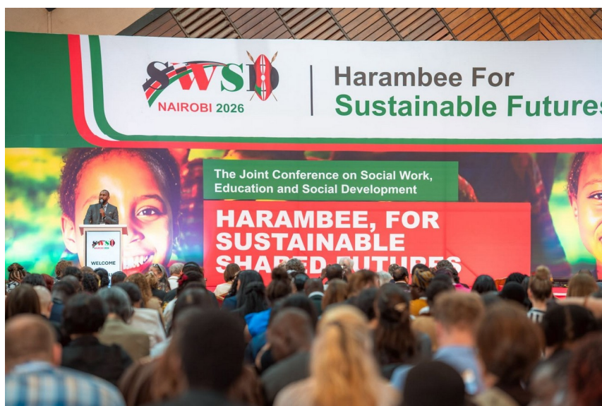
Delegates attending a plenary presentation during the SWSD 2026 Joint World Conference in Nairobi

The 2026 Joint World Conference on Social Work, Education and Social Development, jointly convened by the International Association of Schools of Social Work (IASSW), the International Council on Social Welfare (ICSW) and the International Federation of Social Workers (IFSW), concluded in Nairobi with a renewed commitment to advance the Global Agenda for Social Work and Social Development through strengthened partnership, collective action and a shared commitment to sustainable futures. Guided by the conference theme, " Harambee for Sustainable Shared Futures ," participants affirmed that today's interconnected global challenges require renewed solidarity, bold leadership and sustained investment in people, communities and social systems.